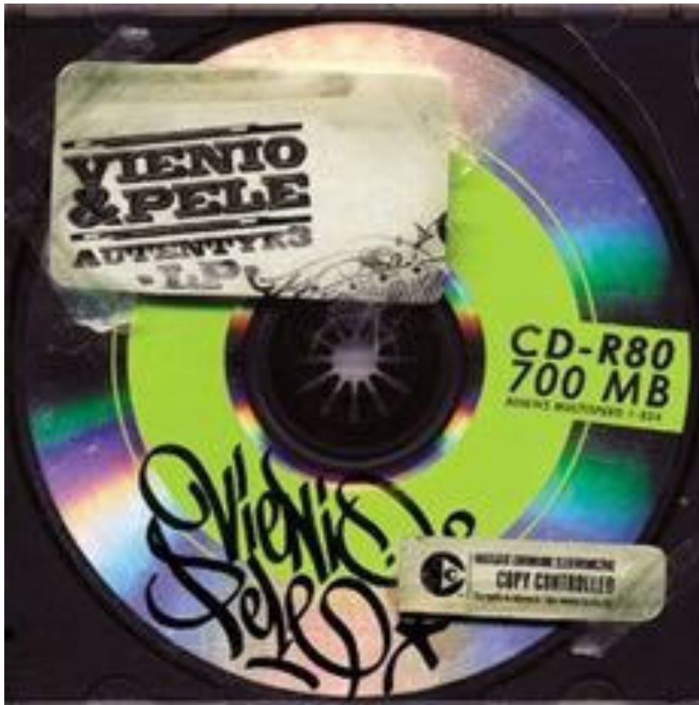
Figure 3. The cover of the album Autentyk 3 by Vienio & Pele.

Artwork & art direction: Grzegorz "FORIN" Piwnicki @ www.projektowanie.org . Used by permission of the author.