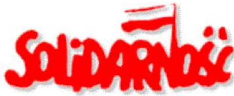
Figure 1. “Solidarność”

There is a long tradition in Poland of using graffiti as a symbol of protest and resistance. The famous “Solidarność” (the Polish word for “solidarity”) logo, which laid the foundations of the international visual legacy of the 1980s in Poland, is a particularly potent example.