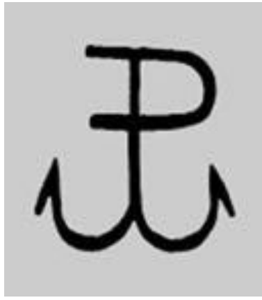
Figure 2. “Polska walcząca”

The letters P (for “Poland”) and W (for “Walcząca,” which translates as “fighting”) are combined to make a stylized anchor. This symbol of hope was drawn on walls as a manifestation of resistance. Such a use of graffiti was socially acceptable and even supported as an act of disobedience towards an establishment collectively disapproved of by the people. Because of the shortage of goods, the graffiti of the 1980s were painted exclusively with simple tools such as brushes, rollers, and stencils.