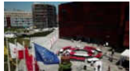
Poland celebrates 30 years since 1989 elections amid dispute over communist legacy

"I want to thank those who took part in the strikes. I thank the people who in recent years, when need came, took to the streets to continue the work of